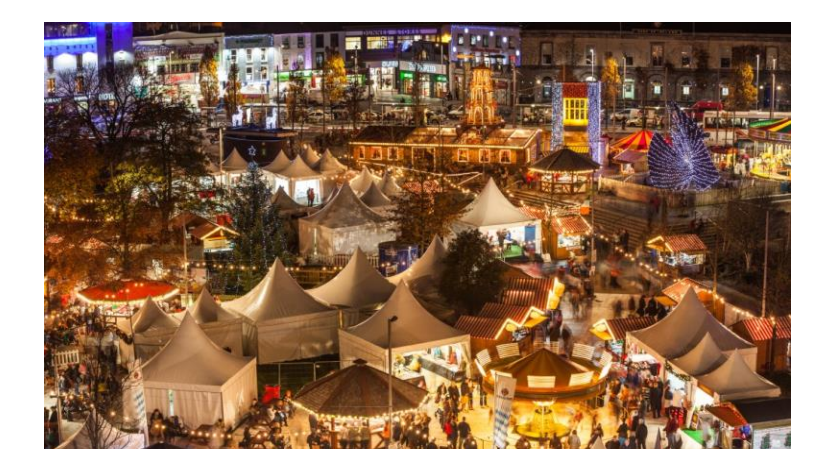
Galway Christmas Market, Eyre Square, adjacent to the conference dinner venue (Meyrick Hotel)